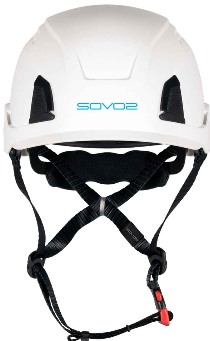
Interchangeable Shell Covers